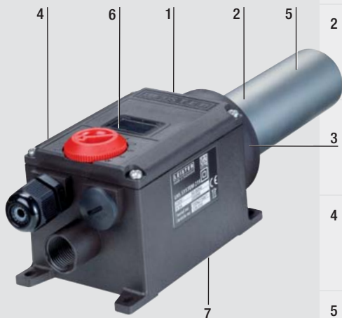
Picture: LHS 21S SYSTEM